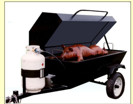
E-Z Way Towable Roaster

Our new Black Powder Coat Finish is heat resistant to 1000° F and has been specifically designed for the extreme temperatures generated by charcoal. This high quality, baked powder coat finish is more durable and uniform than paint. It is stronger because the powder coat actually forms a chemical bond with the metal making it resistant to heat, scratches, corrosion, UV light and fading. Over time, powder coat finishes retain their original appearance longer, protect your grill against corrosion longer and significantly reduces the cost of periodic refinishing.