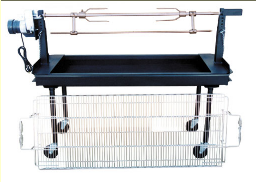
Shown is the M-250B Charcoal Rotisserie. Ideal for Pig Roasts.